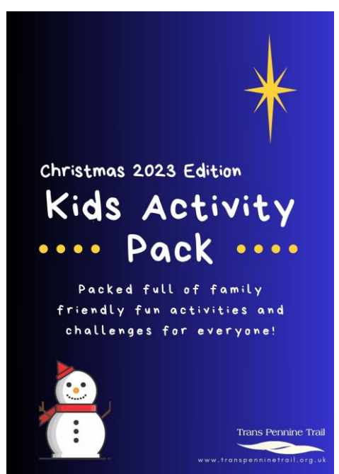
Kids Christmas Activity pack is now available to download

We're delighted to let you know that our latest Kids activity pack, full of fun activities for the Christmas holiday season is now available to download.